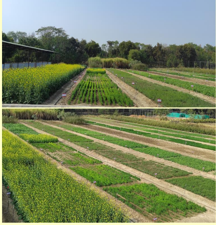
Fig. 3: View of crop cafeteria during Rabi season 2022-23