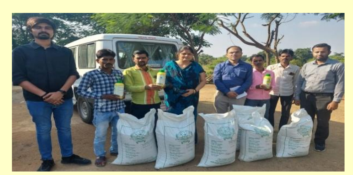
Fig. 10: Seed distribution of FLD

❖ Under the FLD on lentil and field pea (AICRP-MULLaRP), training and seed distribution was organized (Fig. 10) on Oct 21, 2022, among 4 farmers of Sunaura Khiriya and Bamouri villages of Tikamgarh district (2 in lentil and 2 in field pea). Improved varieties of green peas IPFD 10-12 and IPL 316 lentils were given. Also, the seed of lentil IPL 316 and field pea, IPFD 10-12 were given to 6 farmers of Prithvipur Nayakhera of Jhansi district along with plant protection chemicals. (Anshuman Singh, Nishant Bhanu, M. Soniya Devi, Rajeev Nandan).