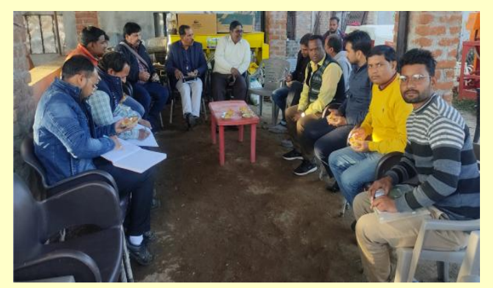
Fig. 28: Meeting with FSSAI officials and FPOs