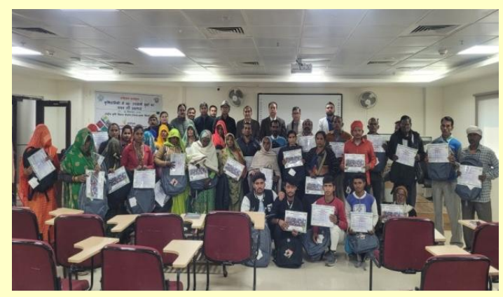
Fig. 25: Distribution of certificates during the training

This Training programme was conducted during Dec, 19-24 2022 for the farmers by Dept. of Silviculture and Agroforestry, CoH&F, RLBCAU, Jhansi sponsored under the RKVY project i.e. "Establishment of Hi-tech Nursery for Quality Planting Material of Agroforestry and Plantation Trees in Bundelkhand Region of Uttar Pradesh". Farmers were imparted with the skilled information on forest trees, their selection and management along with allied sector associated with forestry like fish farming and dairy, nursery raising technique and plantation methods in agroforestry to increase their income and utilize their land through promotion of agroforestry as per National Agroforestry Policy, 2014. During this training Program about 50 farmers of were benefitted (Fig. 25). ( Prabhat Tiwari, RP Yadav, Garima Gupta, MJ Dobriyal ).