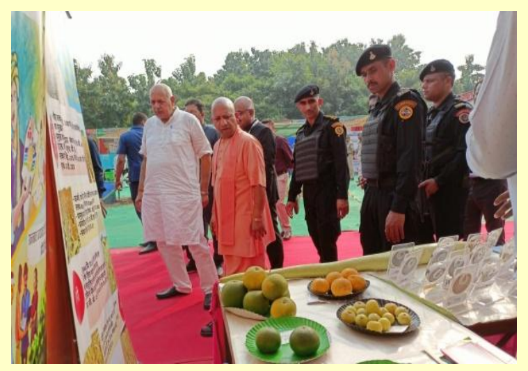
Fig. 19: Union & state Agriculture Minister to the University stall