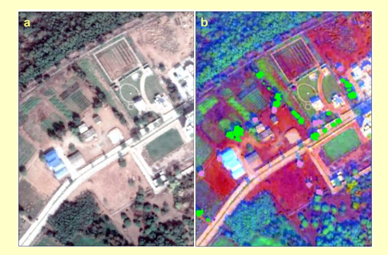
Fig. 1: Instance segmentation using the tree dataset. (a) Initial image in its natural colour (b) PCA image with individually labelled tree crowns.

The image chips used for training and testing must have the same kind, bit count, and number of layers in order for the model intelligence to have the same foundation. Pixel demarcation allows for the detection of the tree object, which is then mapped into a class group. Azadirachta indica tree identification class and ground confirmation are both assessed using recognised pixels that span more than 40% of the canopy cover (Fig. 1). Images with a spatial resolution of 0.5 metres or greater get the best results for tree identification. We were able to collect aerial pictures of Azadirachta indica trees in a variety of places from Microsoft Bing with a spatial resolution of less than one metre. The deep learning segmentation approach was tested for its efficacy in tree identification using photos of tree canopies. To train the model, training picture chips and class labels with dimensions similar to the original data were created.