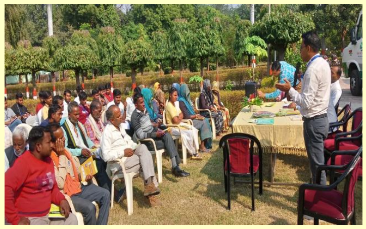
Fig. 26: Field day trainings at Baruasagar (Jhansi, U.P)