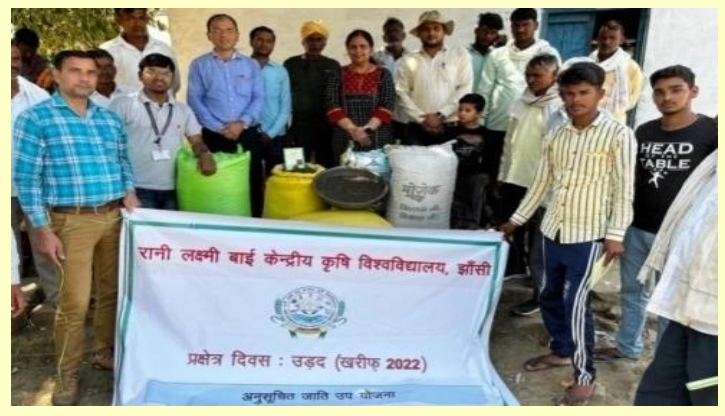
Fig. 9 : Field day at Simardha village, Lalitpur

☆ A Field day-cum-training was organized on Oct 1, 2022, at village Simmardha in district Lalitpur, Uttar Pradesh, under the FLDs Urd bean (SCSP-IIPR), emphasizing the storage of harvested urdbean crop ( Kharif-2022 ) & protection from insect pests (Fig. 9). The farmers appreciated the urdbean variety IPC 2006-77 with respect to the production despite the unfavorable kharif rains. Thirteen farmers out of 115 FLDs could harvest around 4 quintals of urdbean from one-acre land. (Meenakshi Arya, Anshuman Singh, Arpit Surywanshi, Sanjeev Kumar, Sunder Pal).