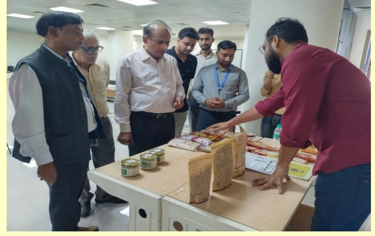
Fig. 5: Exhibition for traditional food

displayed in the exhibition. (GhanShyam Abrol, Pavithra, BS, Ashwani Kumar).