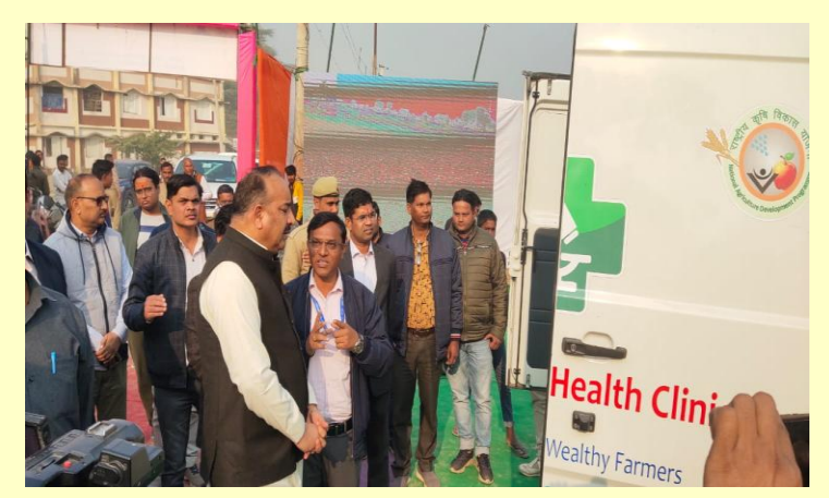
Fig. 22: Virat kisan mela at Bateshwar