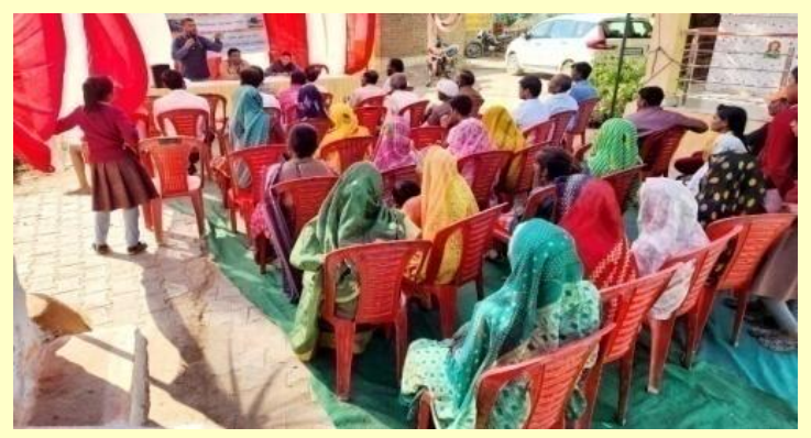
Fig. 16: Field day at the Parwai village

✤ Field day and distribution of plants under the FLD Agroforestry-SCSP-IIPR programme was organized on Dec 17, 2022 at the Parwai village of Jhansi district. Industrial agro-forestry and source of additional income aspects were emphasized. Saplings of agro-forestry trees like teak, siris, neem, karanj , drumstick, and other species were distributed to the farmers. (Fig. 16). (Prabhat Tiwari, Garima Gupta, Prince Kumar).