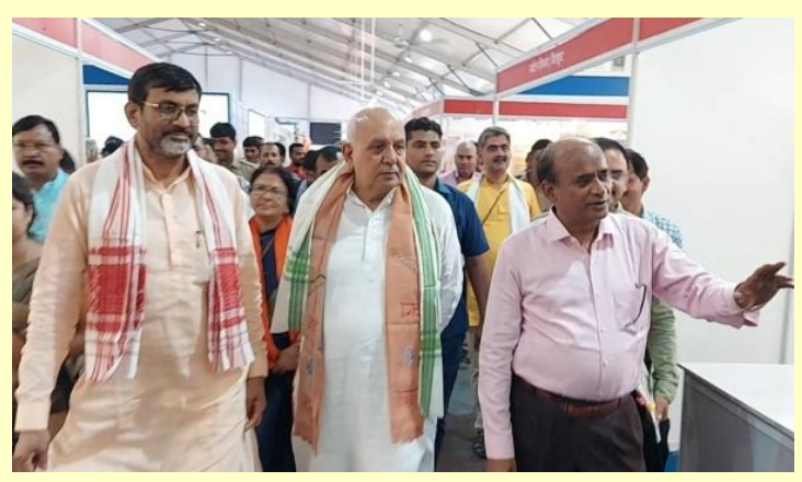
Fig. 18: Hon'ble Agriculture Minister, UP, at the University stall